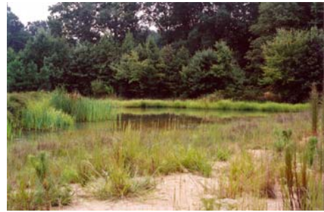
Wetlands prior to filling.

The rear quarter of the site drops off in the opposite direction with considerably more vertical drop than the front portion of the site.